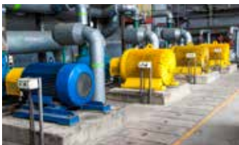
Plant / Equipment Installation