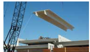
Prefabricated / Modular