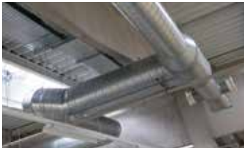
Mechanical / Plumbing